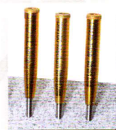
DiamondTome™ Treatment Wands

Parisian Peel® Total Skin Renewal... more options... more opportunities.